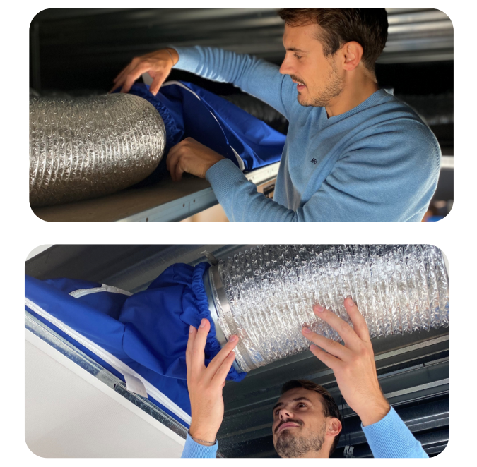
Step 4 Connect the air supply and make sure the diffuser is properly seated.